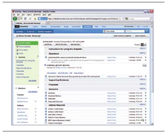
Collaborate about BI content to share insights, gain consensus and speed decision-making.