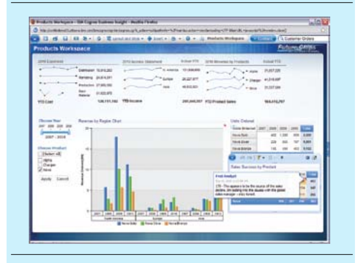
Annotations provide context and insight to data points.

A unified BI workspace gives business users the freedom to compose a dashboard of different but related report parts.