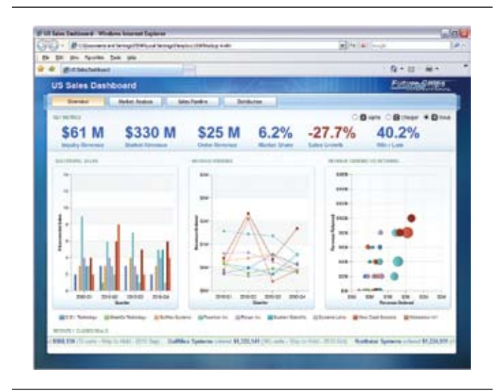
Active Report gives mobile employees a rich, interactive BI experience even when disconnected.